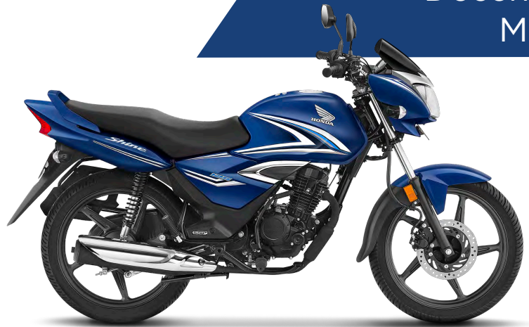
Decent Blue Metallic